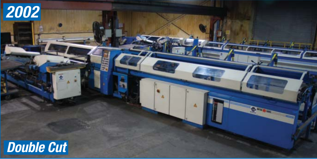
DUTCH BEWO AUTOMATIC CIRCULAR SAW, MODEL DCH-70M