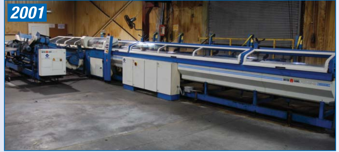
DUTCH BEWO AUTOMATIC CIRCULAR SAW, MODEL FCH-85-M