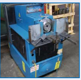
EAGLE SWAGER. MODEL C-2000