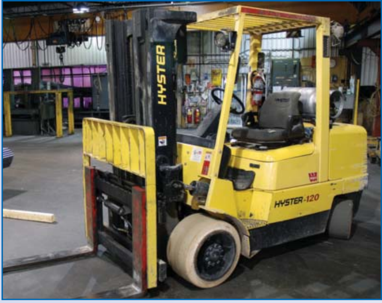
HYSTER 9,600 LB CAP. FORKLIFT, MODEL S120XM