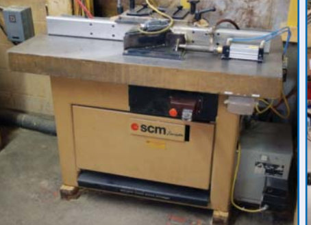
SCM SPINDLE SHAPER, MODEL T-120