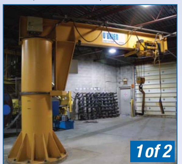
OBRIEN 5 TON JIB CRANE, 15'