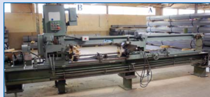
LOOPCO DUAL HEAD FLARING UNIT. 10' CAPACITY