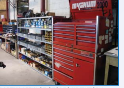
PARTIAL VIEW OF STORES INVENTORY