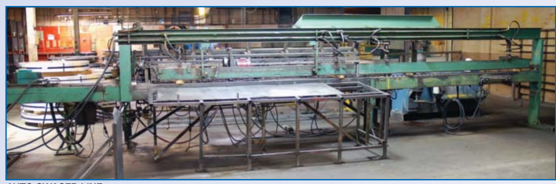
AUTO SWAGER LINE