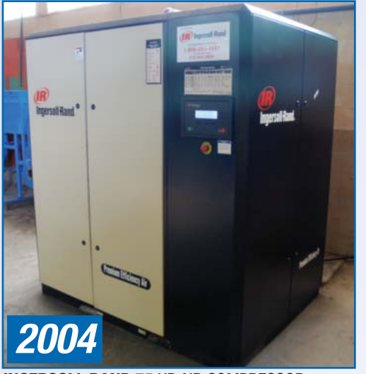
INGERSOLL RAND 75 HP AIR COMPRESSOR