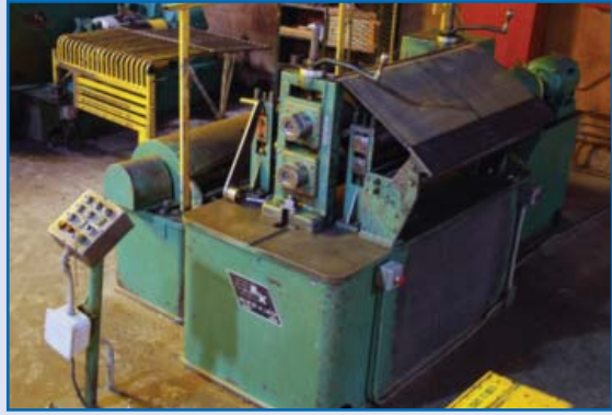
PRESSURE SYSTEMS PRESSURE WASHER, MODEL G40 B & K SLITTLER, MODEL 3S, 36" CAPACITY