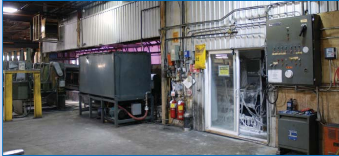
COMPLETE LACQUER LINE