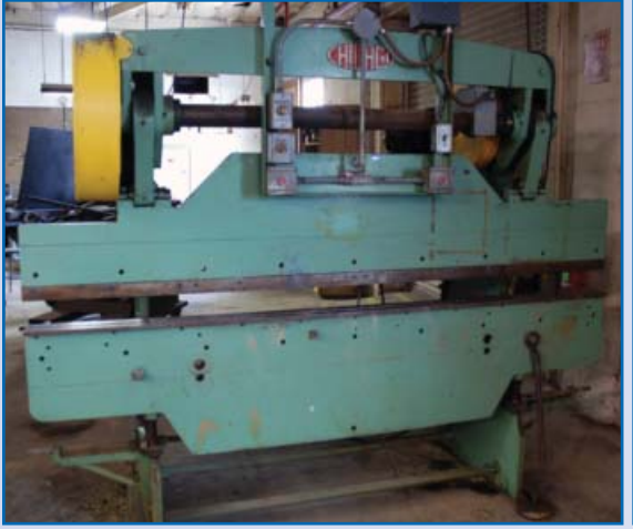
CHICAGO 8' X 35 TON PRESS BRAKE