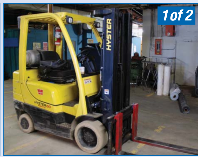
HYSTER 5,000 LB CAP. FORKLIFT, MODEL S60FT