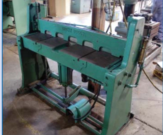
BROWN BOGGS 48" SHEAR